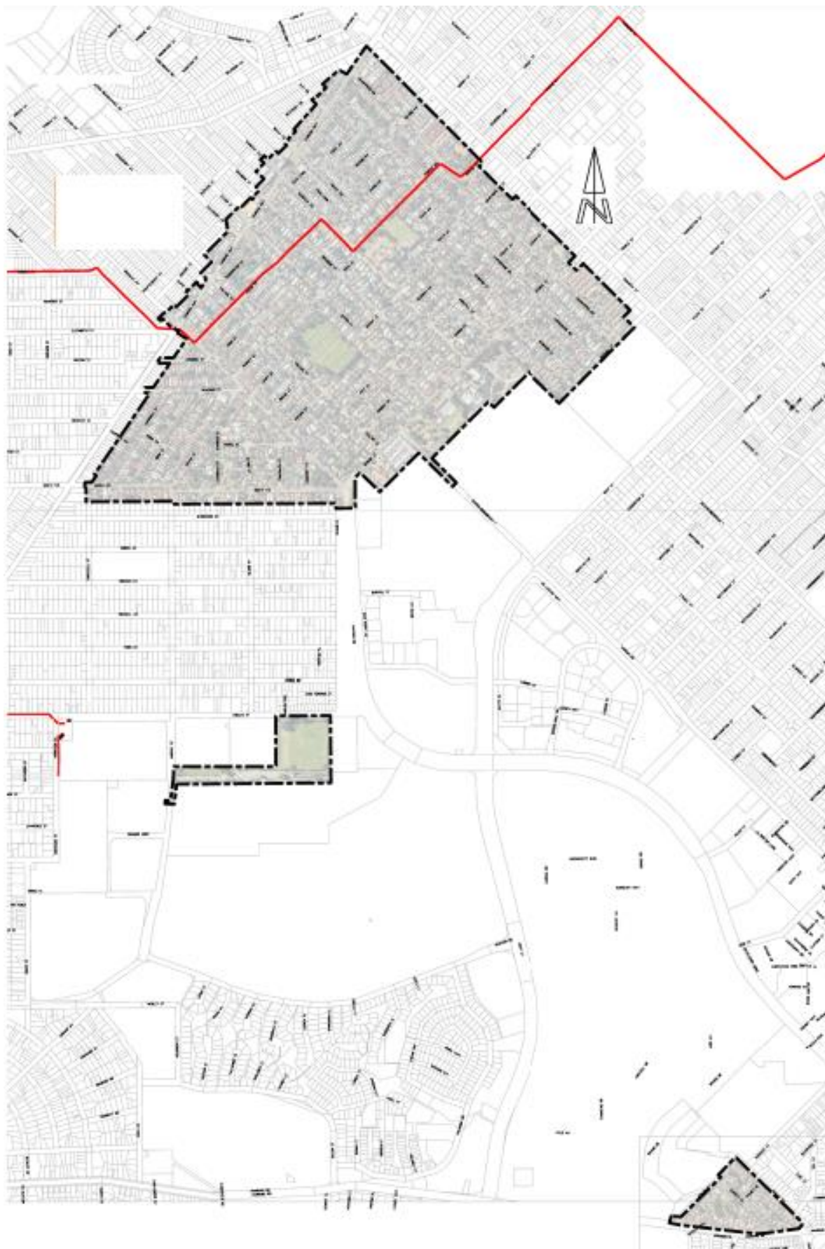
Figure 1: Kensington, Collier Reserve and Waterford Triangle project area