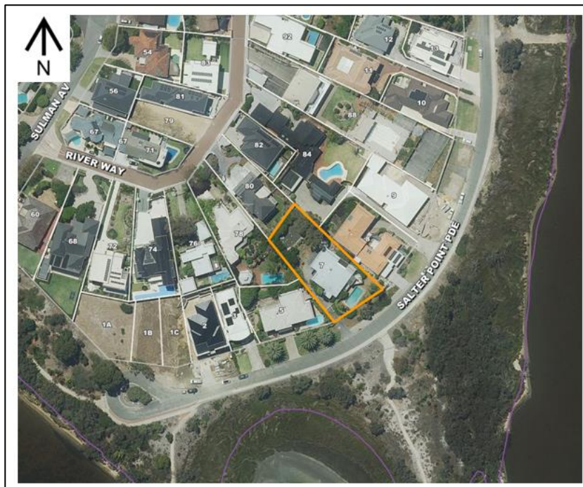
Figure 1: Aerial image of subject site.

The site contains an existing Single House which is located at the front of the site adjacent to Salter Point Parade. The Grouped Dwelling is proposed to be developed to the rear of the existing dwelling, where the tennis court is located. The site is surrounded by Single Houses and Grouped Dwellings as seen in Figure 1 below: