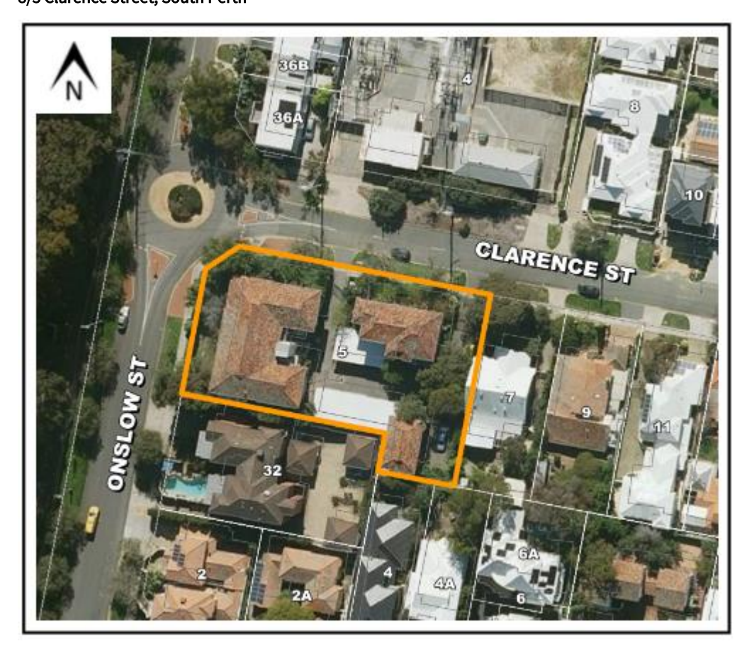
Figure 1: Aerial image of subject site. The property the subject of the application is outlined in red.

The property is within close proximity to the Perth Zoo and within 400m walking distance of Sir James Mitchell Park. The property is also located within 170m to Angelo Street, which contains several cafes, restaurants, retail shops, and supermarkets. These features are of a tourism significance.