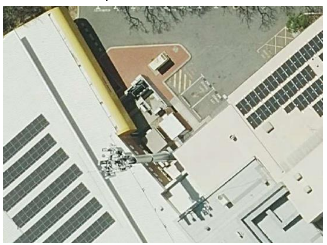
Image 1: Aerial photo of the existing telecommunications facility.