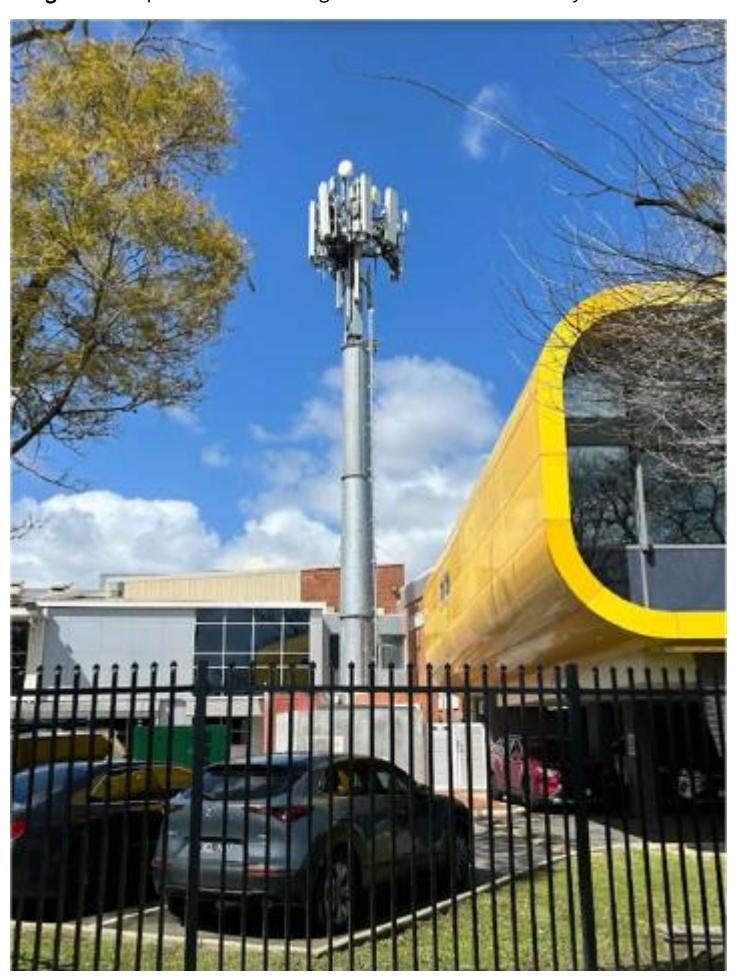
Image 2: Ground level photo of the existing telecommunications facility (facing south).