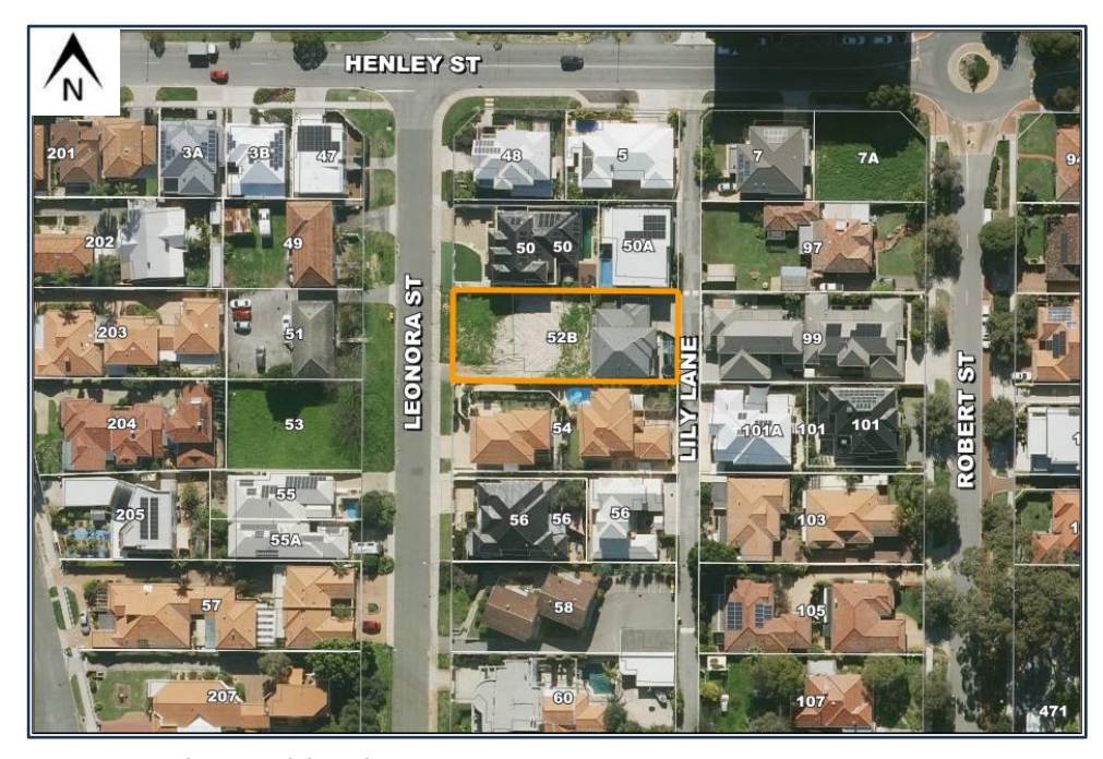
Figure 1: Aerial image of the subject site.