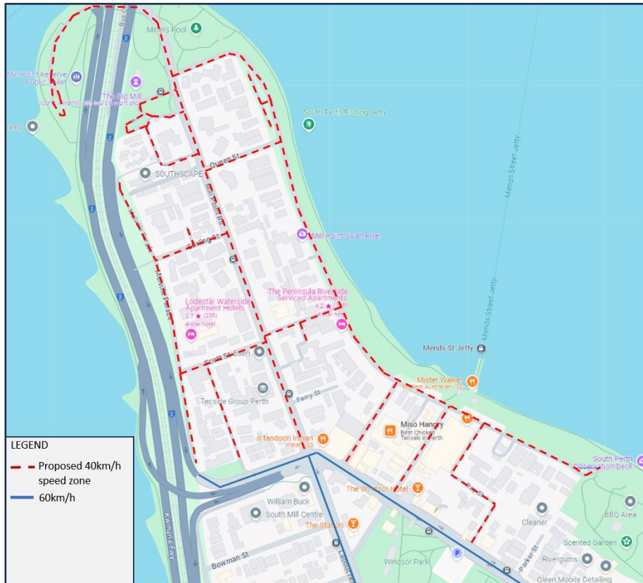
Location Map 4- Proposed 40km/h Speed Zone Area