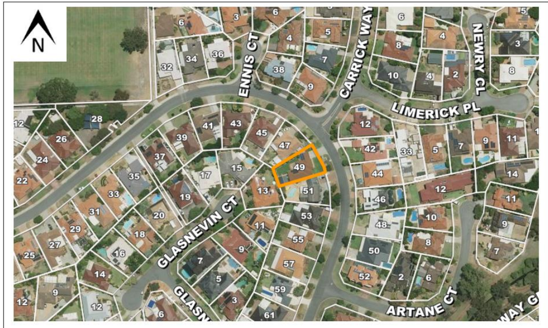
Figure 1: Aerial image of the subject site.

The existing development on the site is a Single House and Outbuilding, and the site immediately abuts Single Houses.