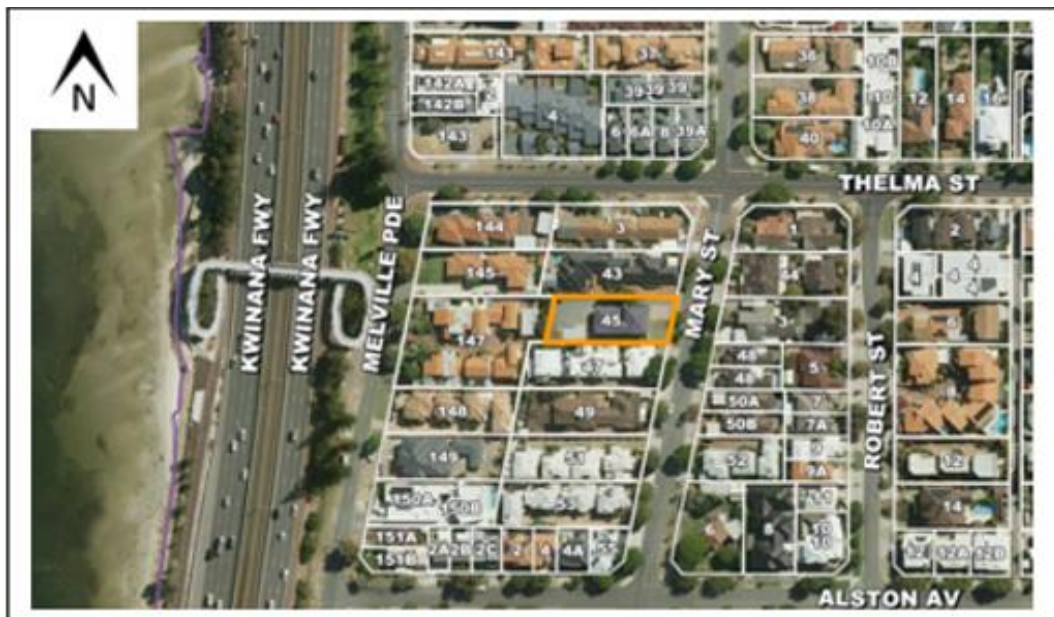
Figure 1: Aerial image of the subject site

The site has frontage to Mary Street and is surrounded by residential development as seen in Figure 1 below: