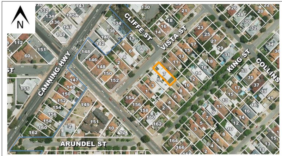
Figure 1: Aerial image of the subject site

The site is located on Vista Street between Douglas Avenue and Cliffe Street, approximately 110m from Canning Highway. The surrounding area comprises of residential uses and commercial development along Canning Highway.