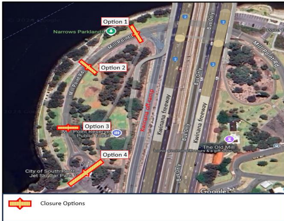
Location Map 3: Option 2 – Proposed Temporary Mill Point Road Closure