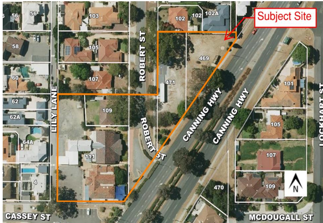
Figure 1: Aerial image of the subject site.

The site has a frontage to Canning Highway to the southeast, Cassey Street to the South, Robert Street to the north and Lily Lane to the west. The site immediately abuts two single storey houses and one two storey single house to the north, as seen in Figure 1 below: