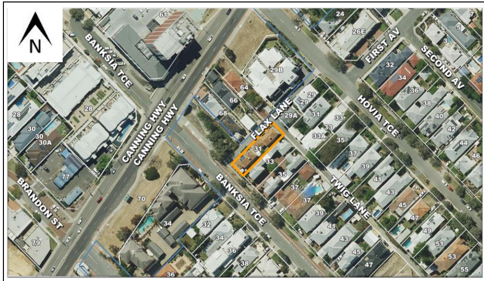
Figure 1: Aerial image of the subject site

The site is located on the corner of Banksia Terrace and Flax Lane, in close proximity to Canning Highway, and is surrounded by a mixture of single house and grouped dwelling developments to the west, north and east as seen in Figure 1 below: