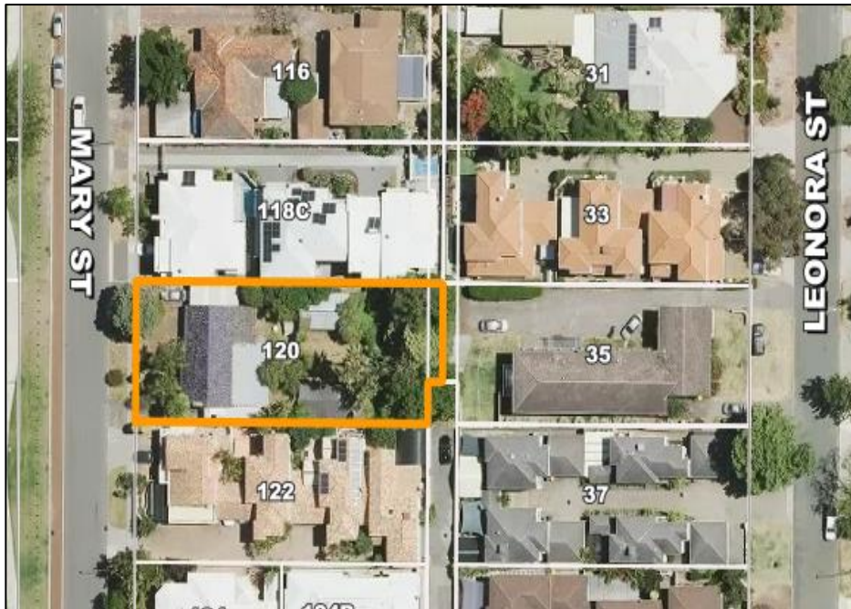
Figure 1: Aerial image of the subject site.

The site has a frontage onto Mary Street, Como, and a laneway access to the rear side of the property. The site adjoins grouped and multiple dwellings to the north, east and the south as seen in Figure 1 below.