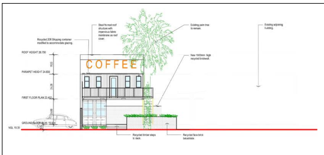
Figure 3: Sign on south western side of proposed building

For illuminated signs near traffic light controlled intersections, P308 requires the following: