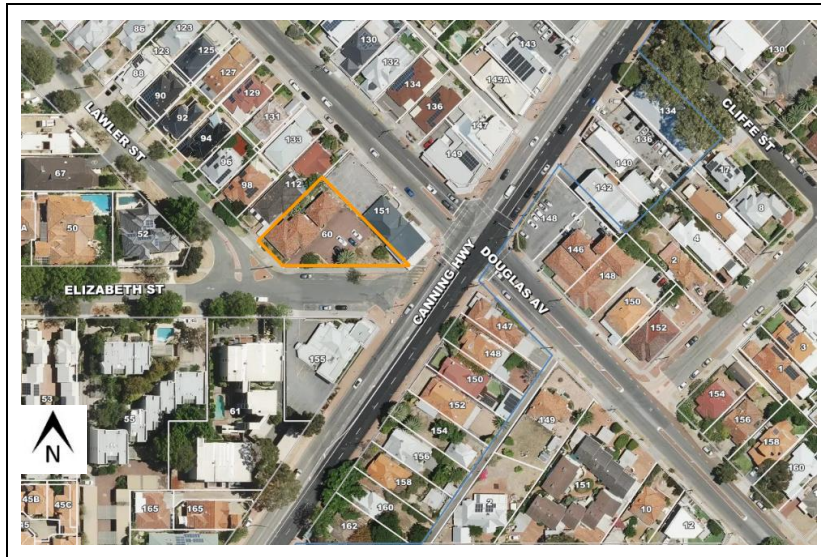
Figure 1: Aerial image of the subject site.

The existing development on the site is a two storey multiple dwelling development in two separate buildings comprising five units as depicted in the site photographs at Attachment (a) .