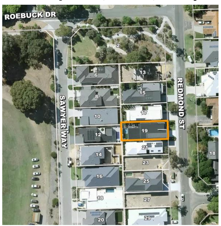
Figure 1: Aerial view of the Site.

The site has a frontage to Redmond Street to the east, located adjacent to single residential dwellings to the north, south and west, as seen in Figure 1 below: