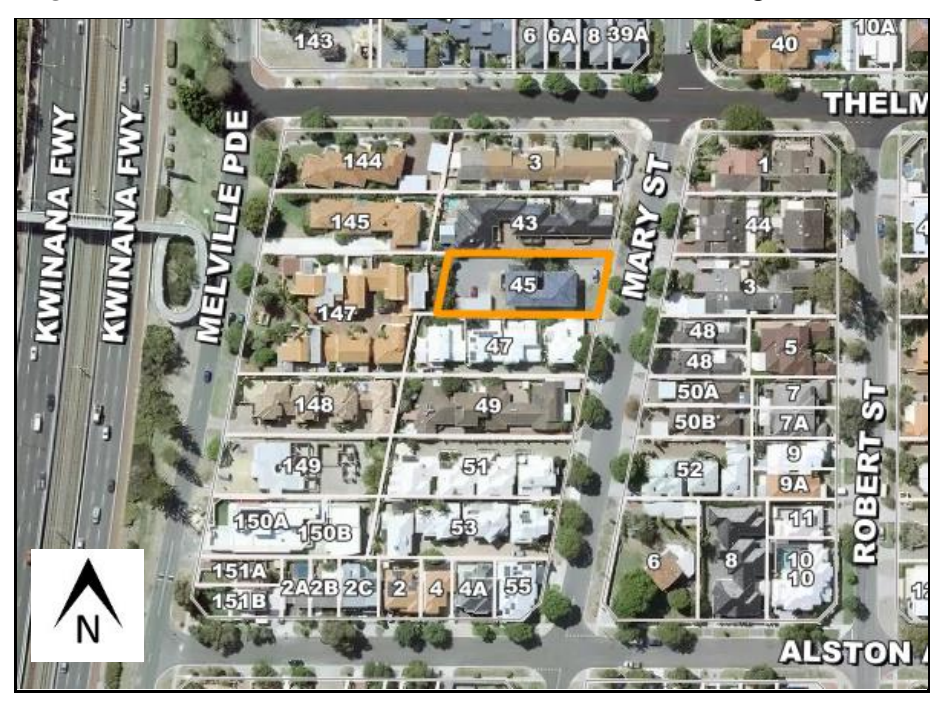
Figure 1: Aerial image of the subject site

The site has a frontage to Mary Street to the east and is surrounded by grouped dwelling developments to the north, west and south as seen in Figure 1 below: