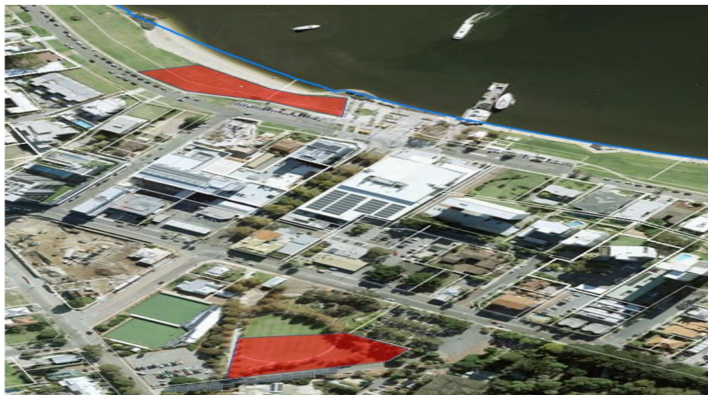
Figure 1: Aerial photograph of the subject site (2021).

The site plan for the proposed exhibition is highlighted in Figure 1 below: