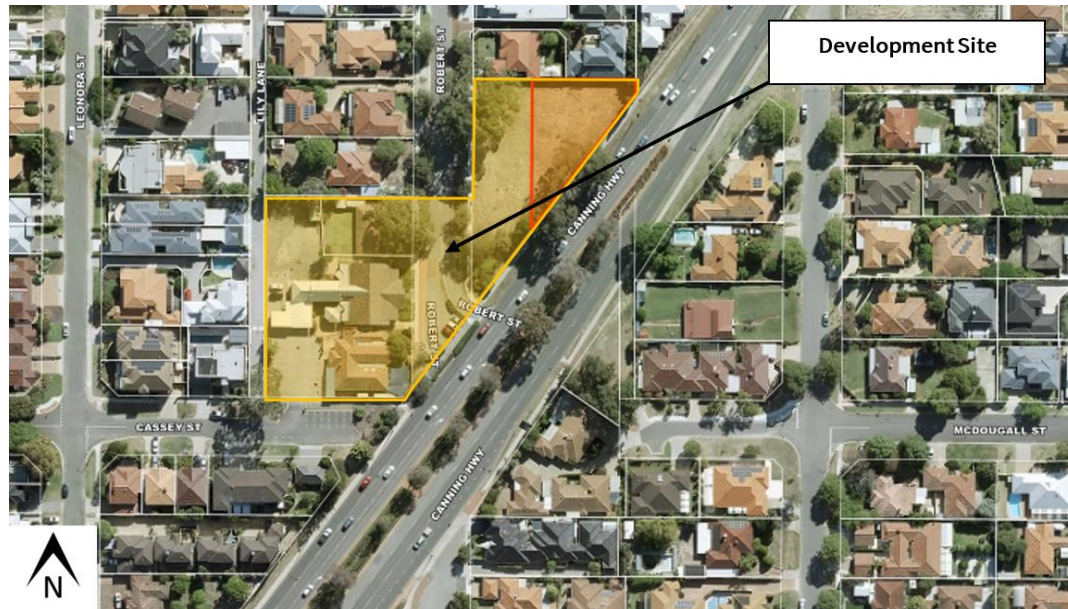
Figure 1: Site Aerial Photograph

The site has a frontage to Canning Highway to the southeast, Cassey Street to the South, Robert Street to the north and Lily Lane to the west. The site immediately abuts two single storey houses and one two storey single house to the north, as seen in Figure 1 below: