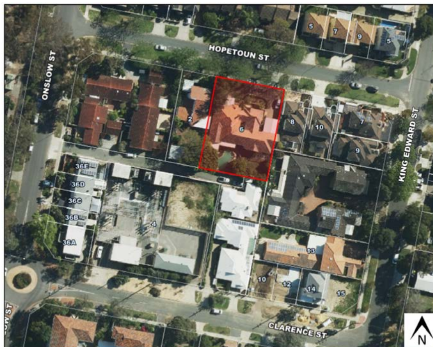
Figure 1: Site Aerial

The site has a frontage to Hopetoun Street to the north, access to a private Right of Way via Onslow Street, a grouped dwelling to the south and is located adjacent to a single house to the west and a single house and grouped dwellings to the east, as seen in Figure 1 below :