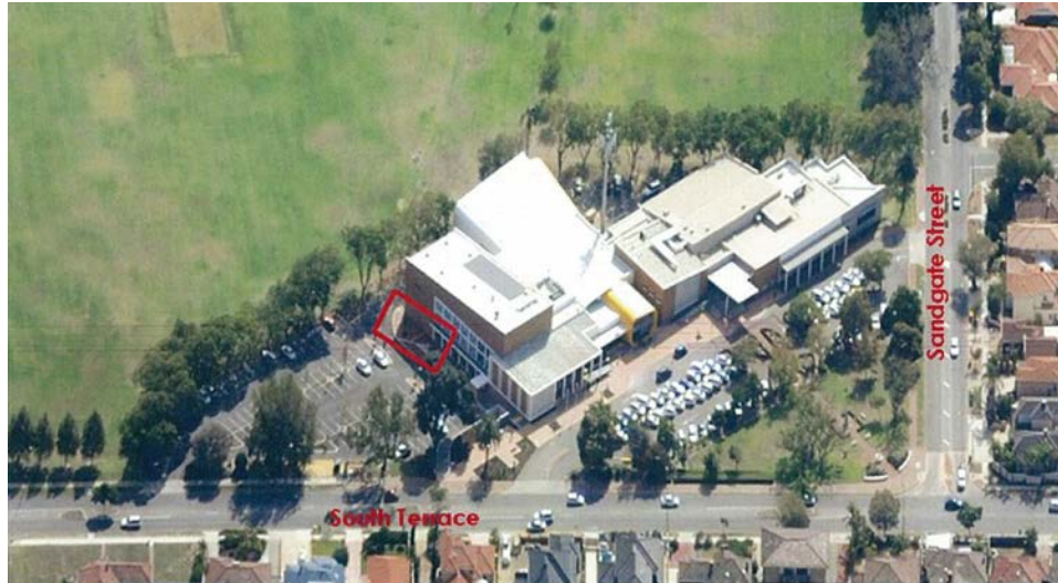
Figure 1: Aerial photograph of the subject site (2020).

The South Perth Learning Centre has a current membership of 654 people.