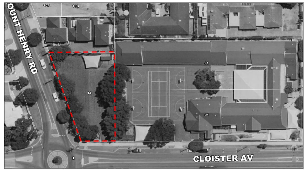
Figure 1: Aerial image of subject site

10.3.1 Proposed Fencing and Signage Additions to Private Institution on Lot 481 (No. 91) Ley Street, Como