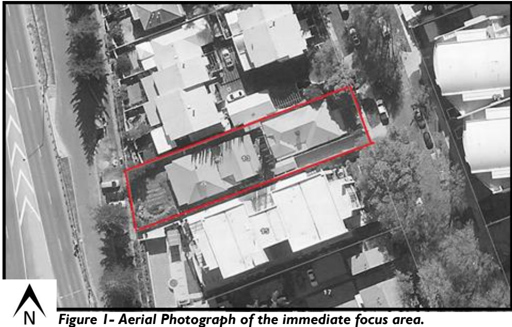
Figure 1- Aerial Photograph of the immediate focus area.