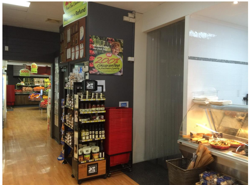
Photo 2 - Existing Manager's room (grey coloured wall) next to thoroughfare within the IGA shop

“Our current office is in a very risky spot as the girls have to pass through a thoroughfare with customers after their shift with a till full of cash. This poses a security risk. When the office is moved upstairs it will purely be a cash office away from the public eye and a lot more secure.”