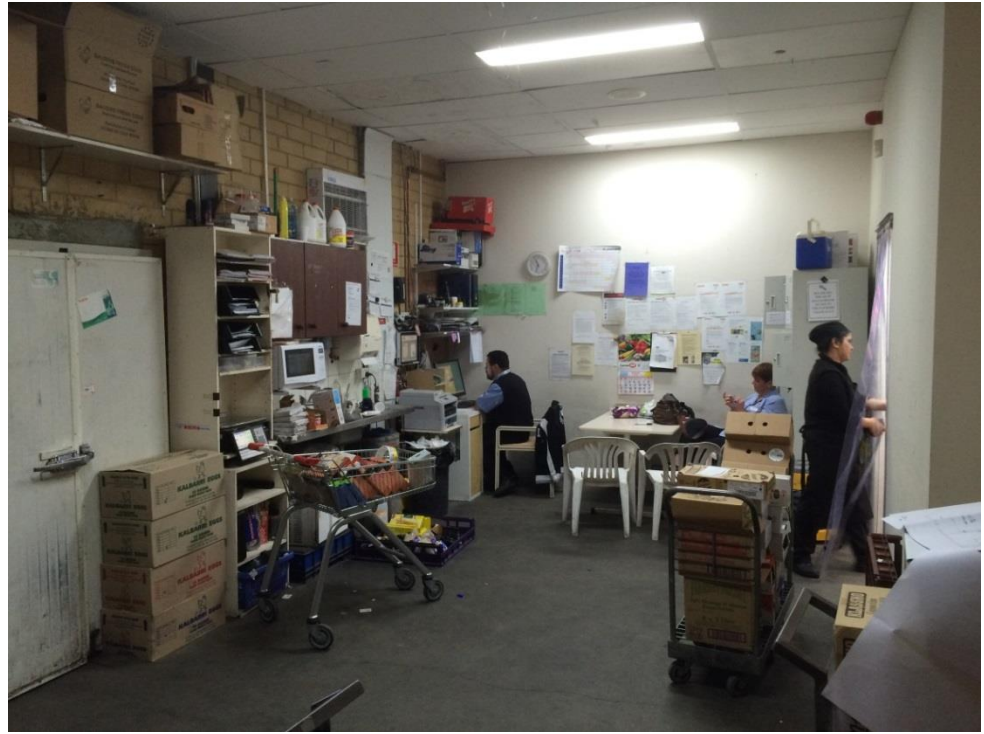
Photo 1 - Existing staff area within the goods store area

“Our current office is in a very risky spot as the girls have to pass through a thoroughfare with customers after their shift with a till full of cash. This poses a security risk. When the office is moved upstairs it will purely be a cash office away from the public eye and a lot more secure.”