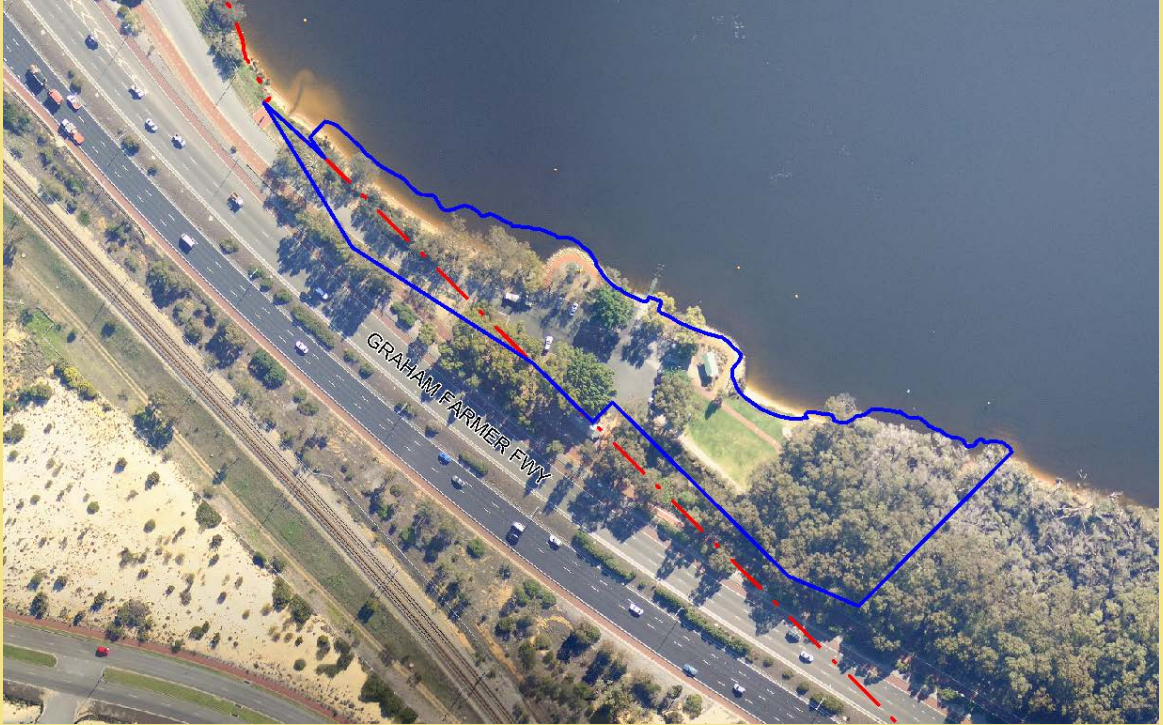
Map 2a: Present Balbuk Reserve sitting over two local government boundaries

--- Present municipal boundary (Town of Victoria Park / City of Belmont) --- Balbuk Reserve