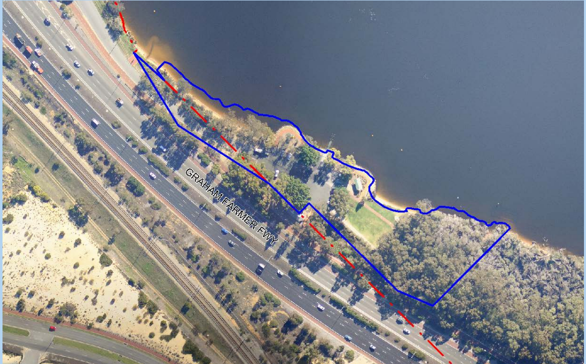
Map 2a: Present Balbuk Reserve sitting over two local government boundaries