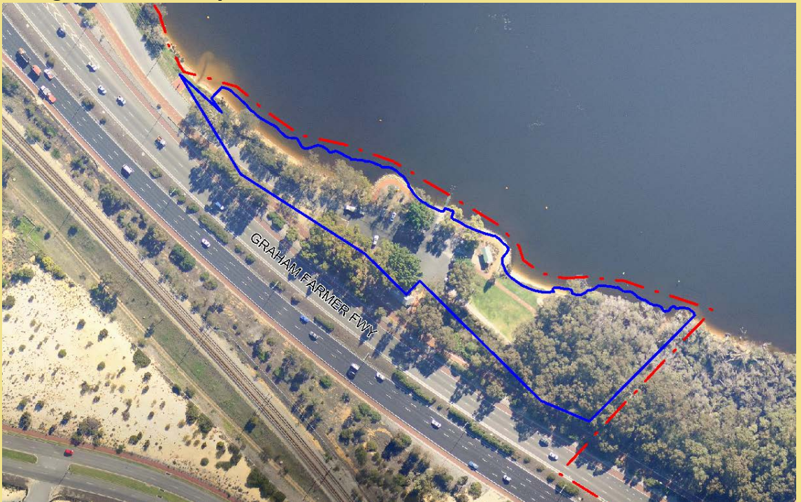
Map 2b: Proposed Balbuk Reserve sitting within the Town of Victoria Park / new local government entity

--- Proposed municipal boundary (Town of Victoria Park / City of Belmont) --- Balbuk Reserve