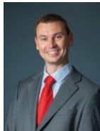
Mayor Greg Milner