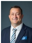
Cr Car Celedin