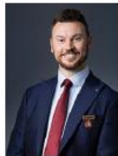
Mayor Greg Milner