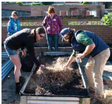
Living Smart - making soil