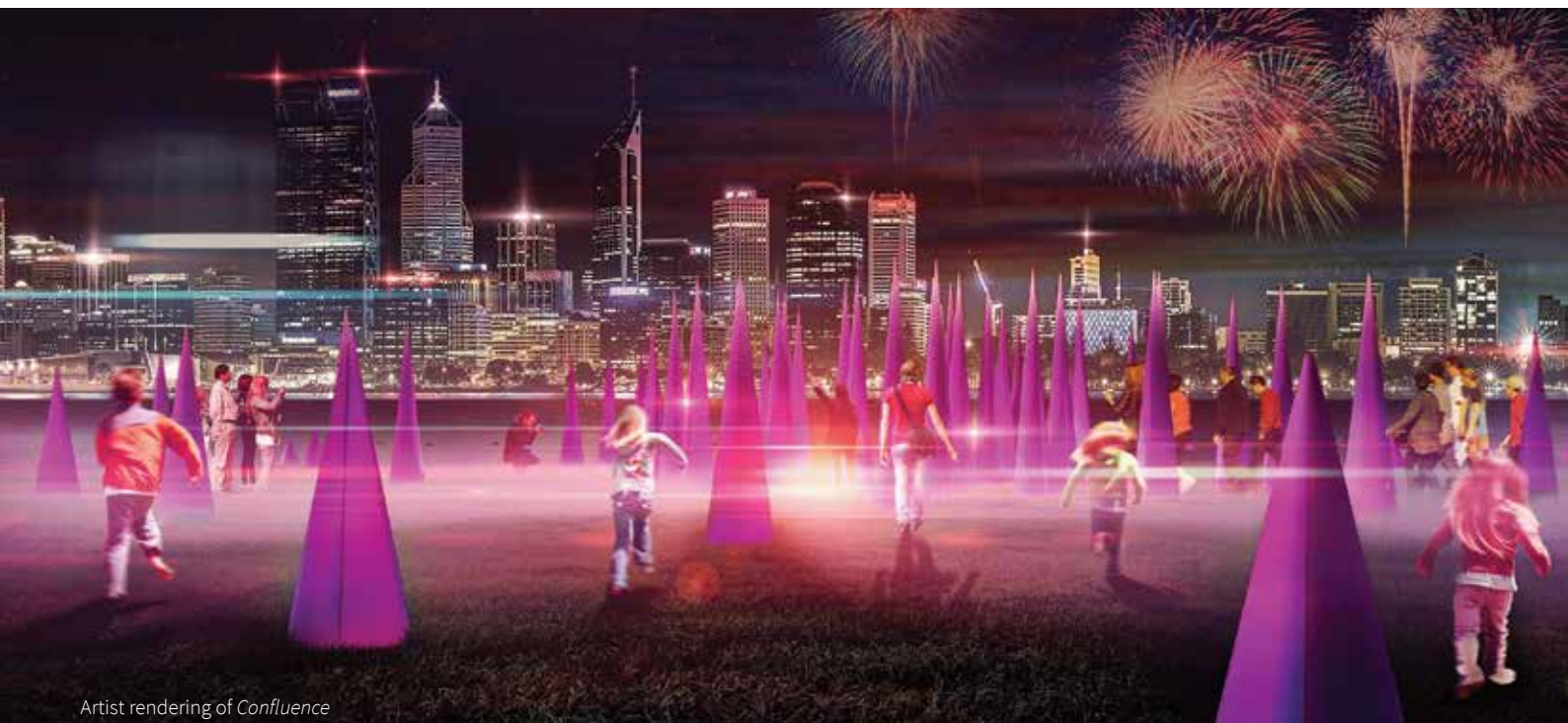
Artist rendering of Confluence