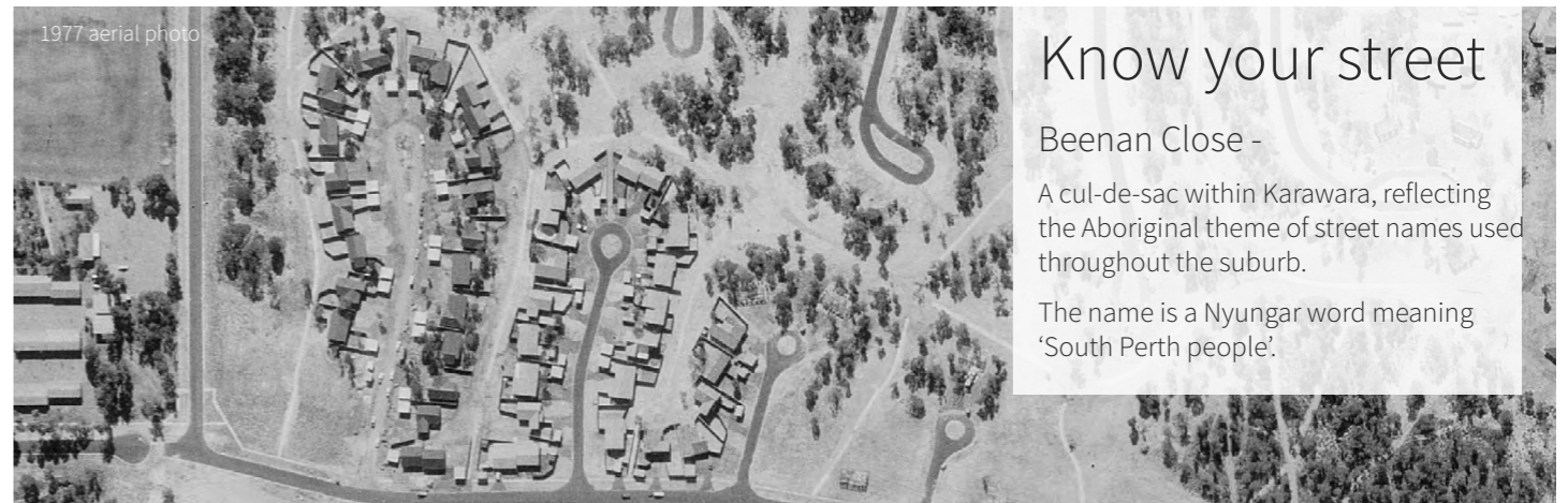
1977 aerial photo

The City is developing an Urban Forest Strategy, scheduled for completion this year, to foster a shared understanding of the change in tree cover in the City over the last 30 years. Once adopted by Council, the Strategy will demonstrate what the City is doing and outline how other institutions and residents can assist us with achieving our goals. In the meantime, let's keep planting trees! ■