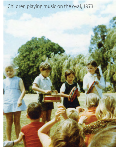
Children playing music on the oval, 1973

Where: Como Primary School, 29 Thelma St, Como. ■