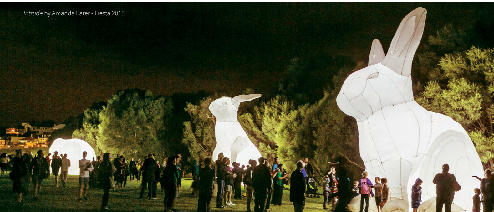
Intrude by Amanda Parer - Fiesta 2015