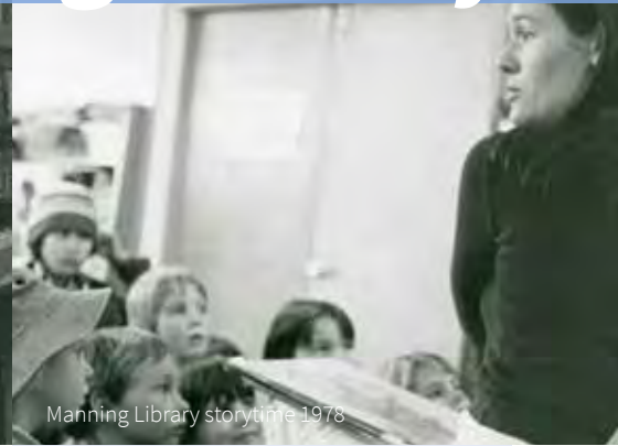
Manning Library storytime 1978

For more than half a century Manning Library has served the community and been a beacon for learning and education.