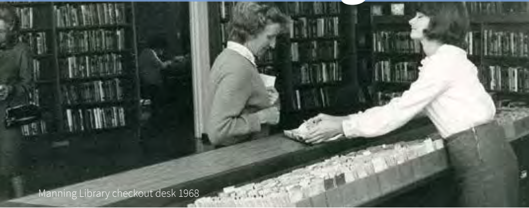
Manning Library checkout desk 1968