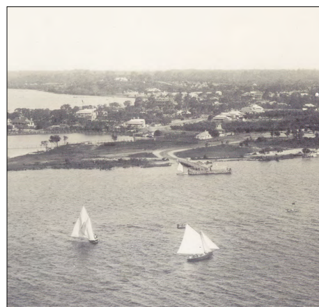
South Perth c. 1890-1901, view from Kings Park

SOUTH PERTH derives its name from its location south of Perth. The area was identified as a separate suburb of Perth in 1831 and the name now applies not only to the City, but also to the suburb.