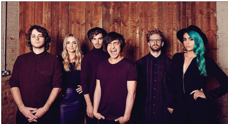
Aria winning band 'Sheppard'

FIESTA RETURNS in 2015 to 'Transform' our City as we celebrate the City's past, present and future identity. Throughout 8 - 21 March, see illuminating public art, roving food vans dotted along our streets and temporary play areas popping up in unique spaces across the City!