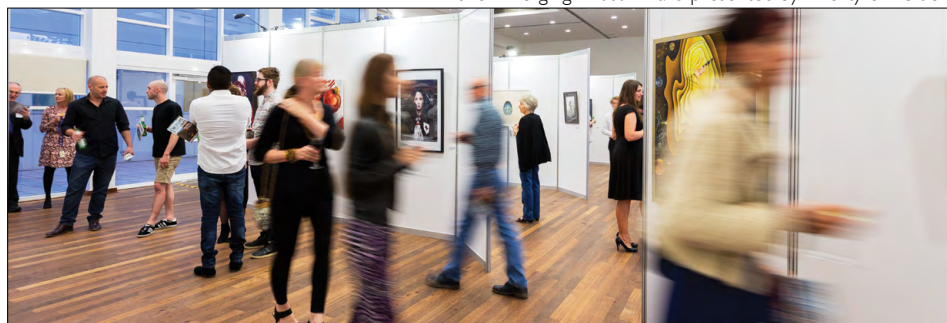
2015 Emerging Artist Award presented by Brierty exhibition

Scan the QR code on the bottom left corner of the cover using your mobile device, to access the Peninsula newsletter online. You will be required to download a QR code reader app.