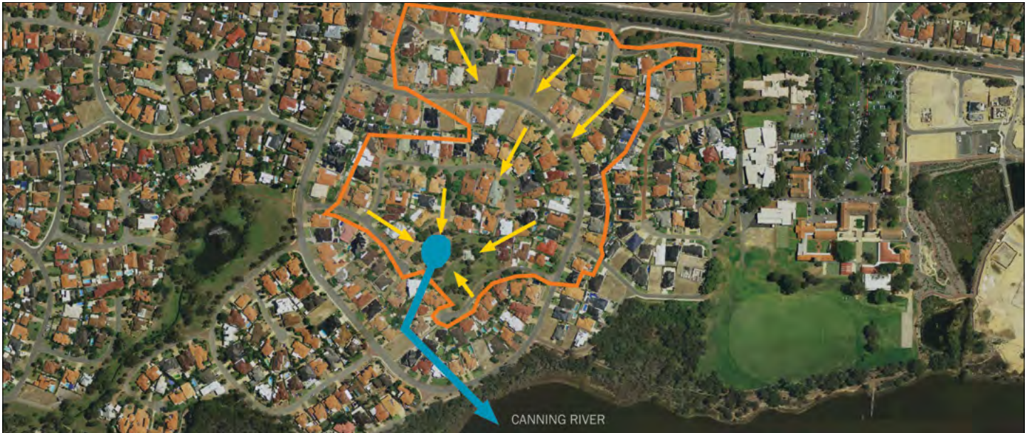
Detail of the stormwater subcatchment of the basin showing contour lines and indicative drainage direction

AS PART OF THE City of South Perth's Water Sensitive Urban Design (WSUD) projects, the drainage basin in local park Doneraile Reserve, Waterford will be upgraded to better treat stormwater runoff and groundwater. The upgrade to the basin will include perimeter vegetation and general improvement in water quality. This will help protect both the local environment and the Canning River.