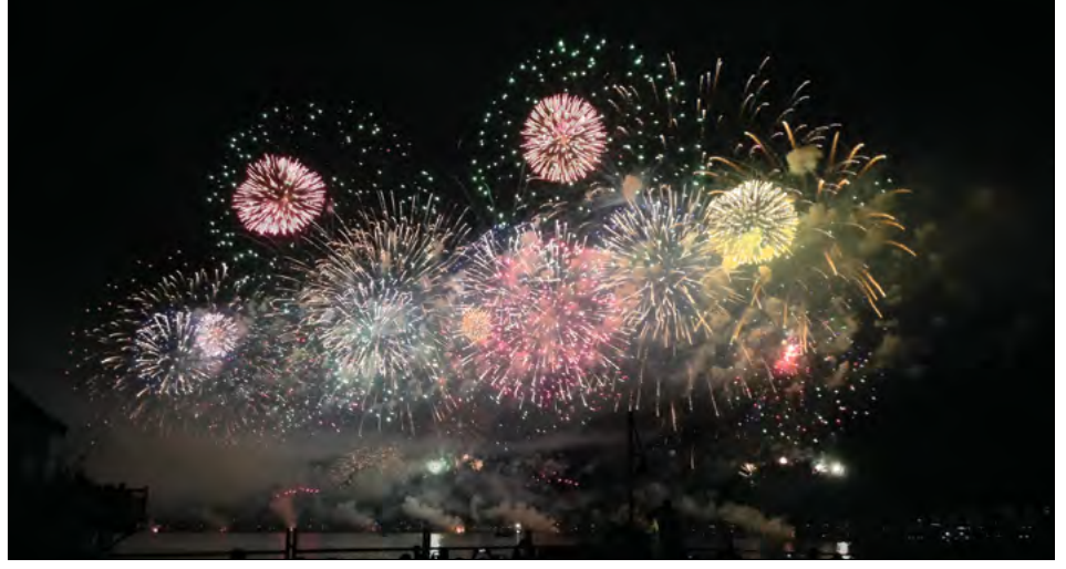
Spectacular fireworks display

Residents, families and visitors from far and wide visited the Zone to take part in over 100 free activities spread across 100,000 squared meters and divided into seven activity zones, including a Toddler and Kids Zone, Kids Theatre, Challenge Area, Sports