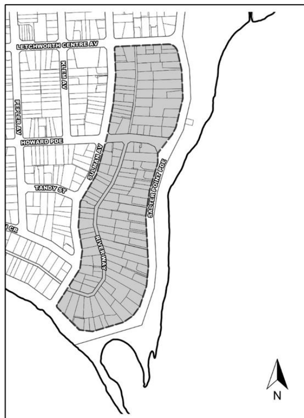
Figure 1: Policy Application Area

This Policy applies to all development on properties outlined in Figure 1. Clause 4.2 of this Policy only applies to properties identified in ASR 12 – Salter Point Escarpment, Salter Point of Schedule B of LPS 7.