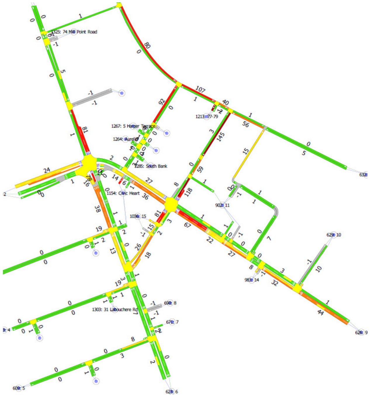
Figure 2 2021 AM Link Delay Plot (seconds) – Committed Developments Only (Excluding 88 Mill Point Road)