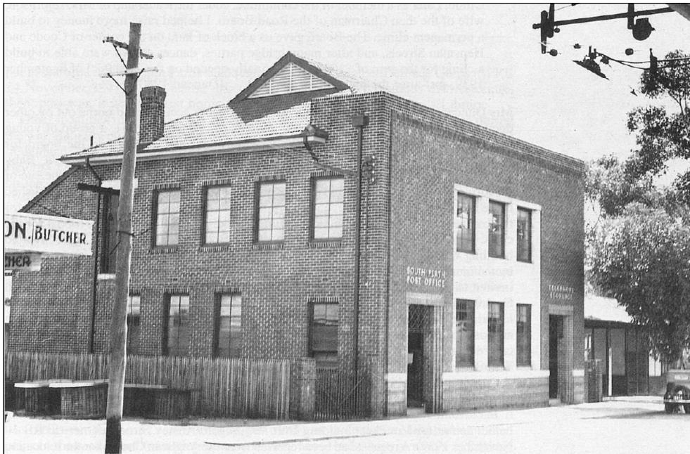
The Angelo Street Post Office, in 1940, about a year after construction. (Florey, page 213.)