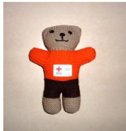
Little Trauma Teddy® (approximately 23cm tall)