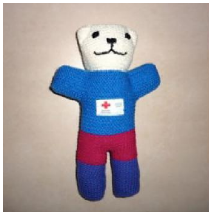
Original Trauma Teddy® (approximately 32cm tall)

Never hand out a Trauma Teddy® until it has been inspected by your local coordinator and the Red Cross identification label has been sewn (not glued) onto Trauma Teddy's tummy.