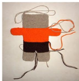
Original Trauma Teddy ® (approximately 28cm)