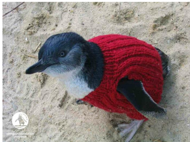
Little penguin in knitted jumper recovering from oil pollution at the Phillip Island Wildlife Clinic